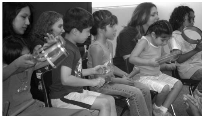
Room 5, performing for families and friends at the Annual Awards Program.