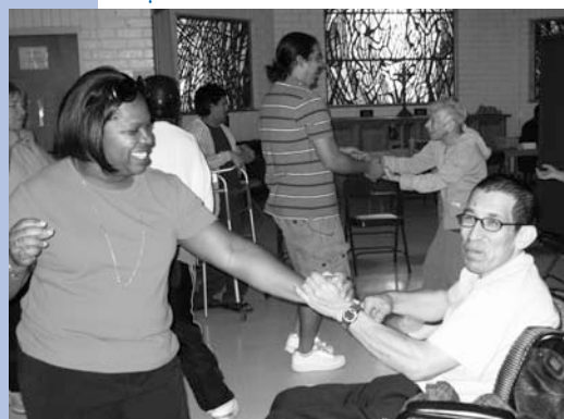
ADP Staff and Participants having a great time dancing together.

Source: The National Family Caregivers Association http://www.familycaregiving101.org/