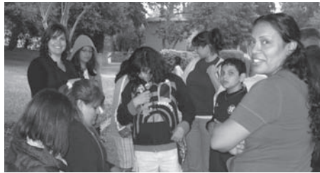
Villa staff and families at the picnic.