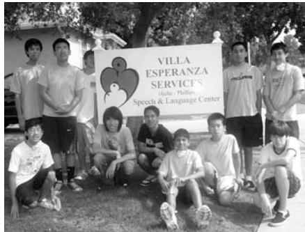
Boy Scouts from Troop 351 posing after a weekend of hard work.

Each year Villa is blessed to have Boy Scouts volunteer their time and talents to improve our campus while working on their Eagle Scout project.