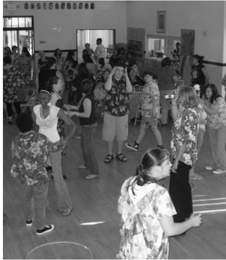
Students, parents and staff dancing the night away.