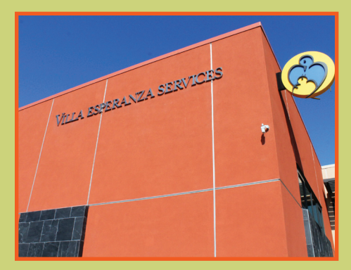
"It finally feels like a real school."

We are grateful for the generosity of ALL our donors who made Phase I of our new campus a reality. A special thank you to the Ayrshire Foundation and Wells Fargo, for each contributing lead gifts of $1 million to the project.