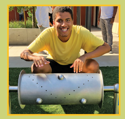
"The Campus feels fresh, organized and so much more functional."